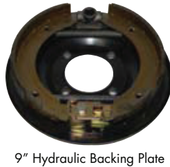
9" Hydraulic Backing Plate Part No. 920-012