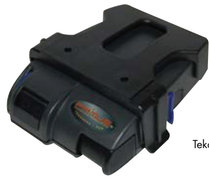
Tekonsha Electric Brake Controller Part No. 920-880