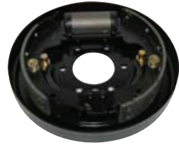
9" Mechanical Backing Plate Part No. 920-011