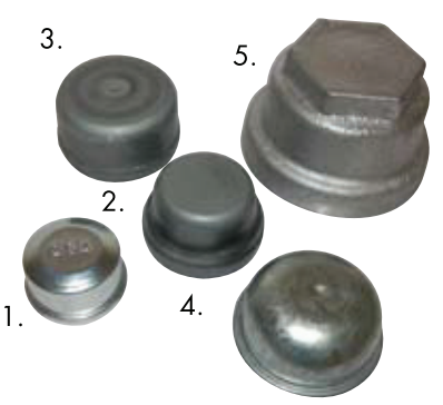
1. A / B 1 3/4" Grease Cap Part No. 900-455 2. B Parallel 2 1/2" Grease Cap Part No. 900-480P 3. C Type 2 1/16" Grease Cap Part No. 900-457 4. D Type 2 7/16" Grease Cap Part No. 900-465 5. F Type Screw in Grease Cap Part No. 900-475