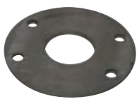
Hydraulic Anchor Plate - Suit 9" Backing Plate Part No. 920-802A/B