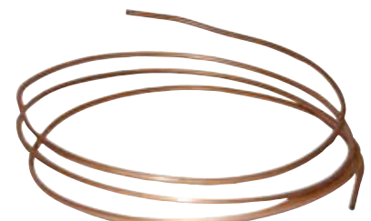
3/16" Brake Line Part No. 920-830