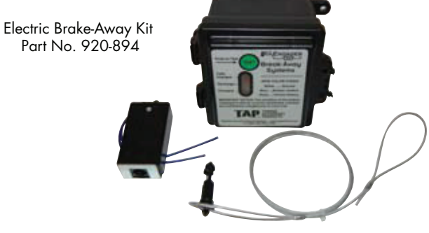
Electric Brake-Away Kit Part No. 920-894