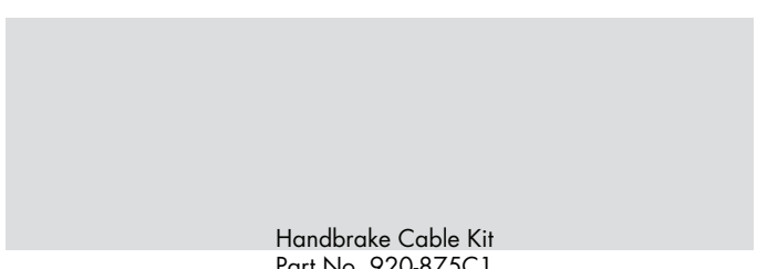
Handbrake Cable Kit Part No. 920-875C1