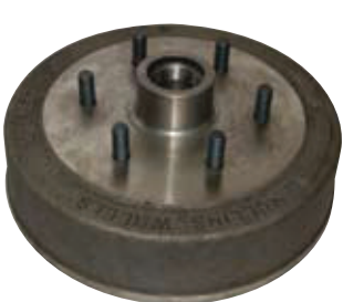
Hub Drum - B Type - Studded & Cupped Only L/C - 6/5.5" PCD Part No. 920-1ZB67