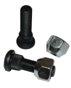
Wheel Studs & Tapered Wheel Nuts