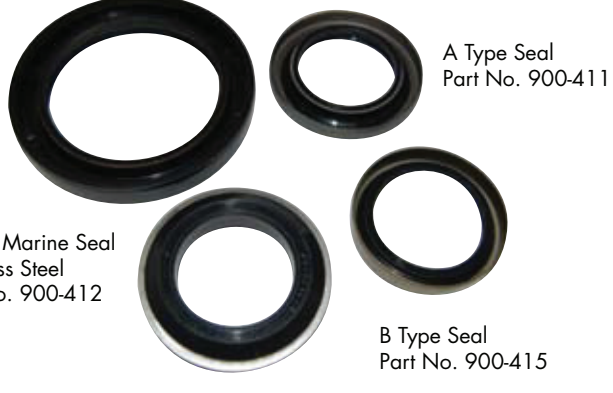
B Type Marine Seal Stainless Steel Part No. 900-412