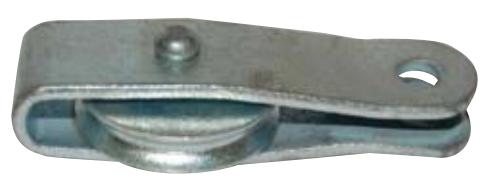
Handbrake Cable Pully Roller Part No. 920-873